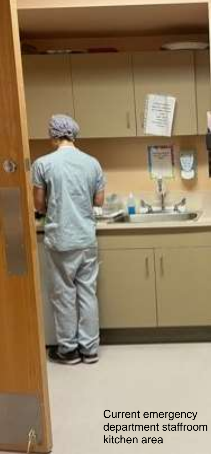
Current emergency department staffroom kitchen area