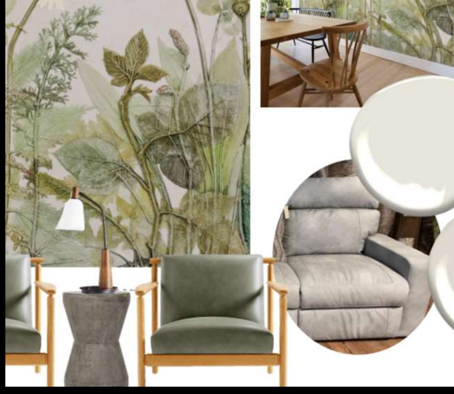
Design concepts for staffroom updates