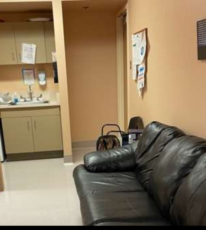
Current emergency department staffroom